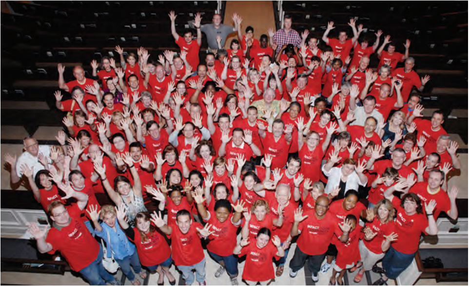
Over 100 North Texas United Methodists gathered at St. Andrew UMC, donned red T-shirts and fanned out to numerous service sites across North Texas.