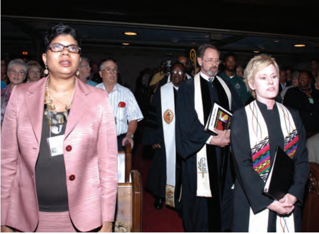
Opening worship service began with heartfelt praise.