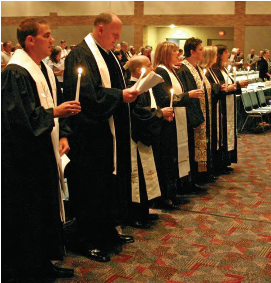
The ordinands lit candles during the Memorial service in memory of deceased clergy members and clergy spouses.