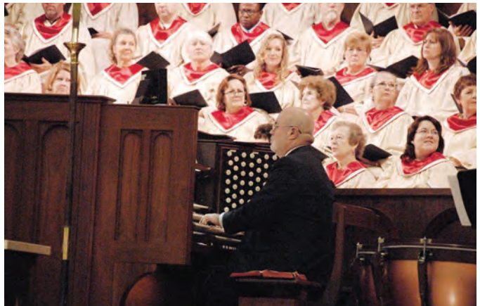
The FUMC Plano choir offered beautiful music.