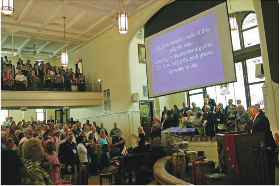
The Laity Session was held at St. Paul UMC.