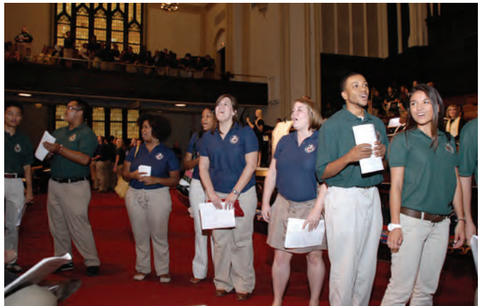
Project Transformation interns brought youthful zest to the service.