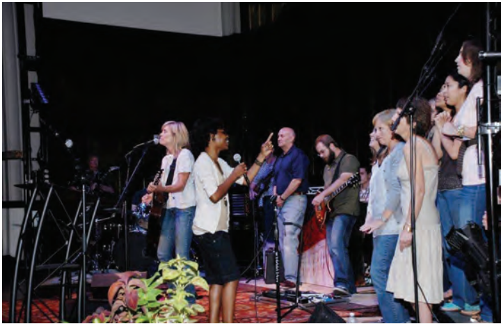
Munger Place Band brought energy to the Clergy Session.