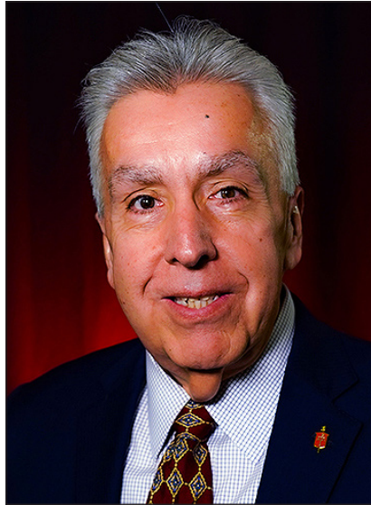
Bishop Ruben Saenz Jr. North Texas Conference of The United Methodist Church

Bishop Ruben Saenz Jr. is a native of South Texas and a lifelong United Methodist. He was elected bishop at the 2016 South Central Jurisdictional Conference and was assigned to the Great Plains Conference, effective September 1, 2016. While serving as resident bishop of the Great Plains Conference, Bishop Saenz was also assigned to provide episcopal coverage for the Central Texas Conference, beginning January 1, 2022. Effective January 1, 2023, Bishop Saenz was assigned as resident bishop of both the Central Texas Conference and the North Texas Conference.