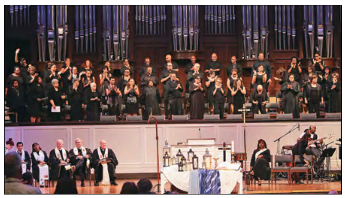
A multi-church choir comprised of members from St. Luke "Community" UMC, St. Paul UMC, and Hamilton Park UMC provides music for the opening worship of the 2016 Annual Conference.