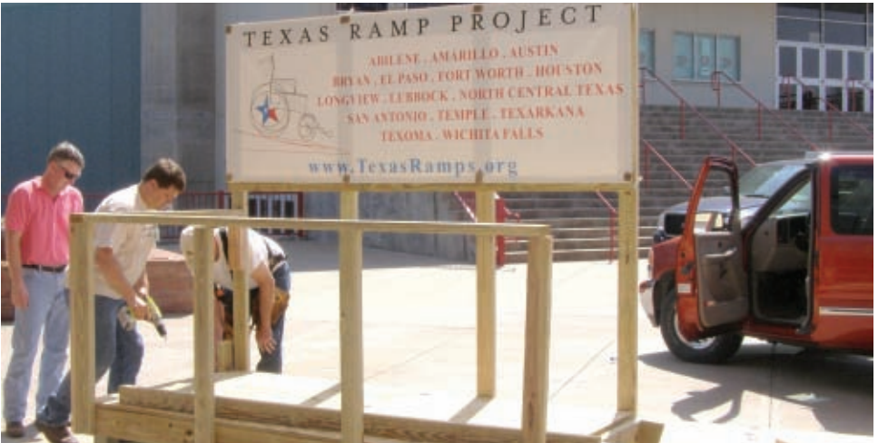
Volunteers from the Texas Ramp project demonstrate handicap ramp building techniques outside the MPEC Center.