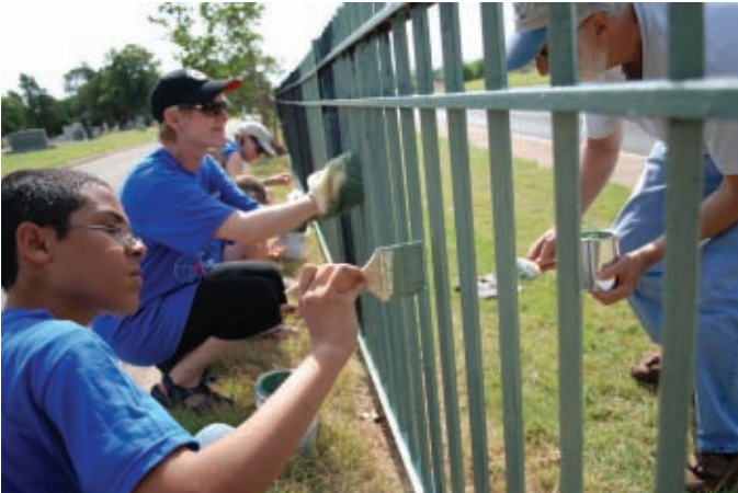
Volunteers help paint fences at Wichita Falls' historic Riverside Cemetery.