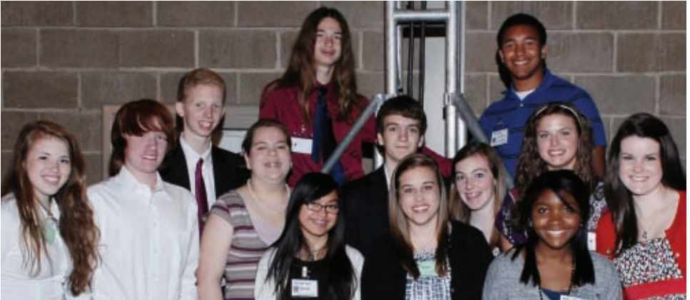
Below, youth members of annual conference gather for a group photo.