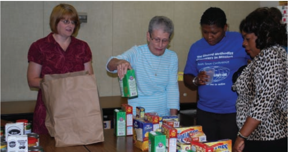
Day of Service volunteers receive instructions before going to work in the Floral Heights food pantry.