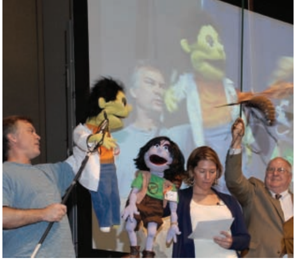
Puppets Dr. Mal Aria and Dr. Nettie Goodwater share the spotlight during the Imagine No Malaria report.