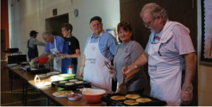
Volunteers get Wednesday's Day of Service off to a good start cooking pancakes at Floral Heights UMC.